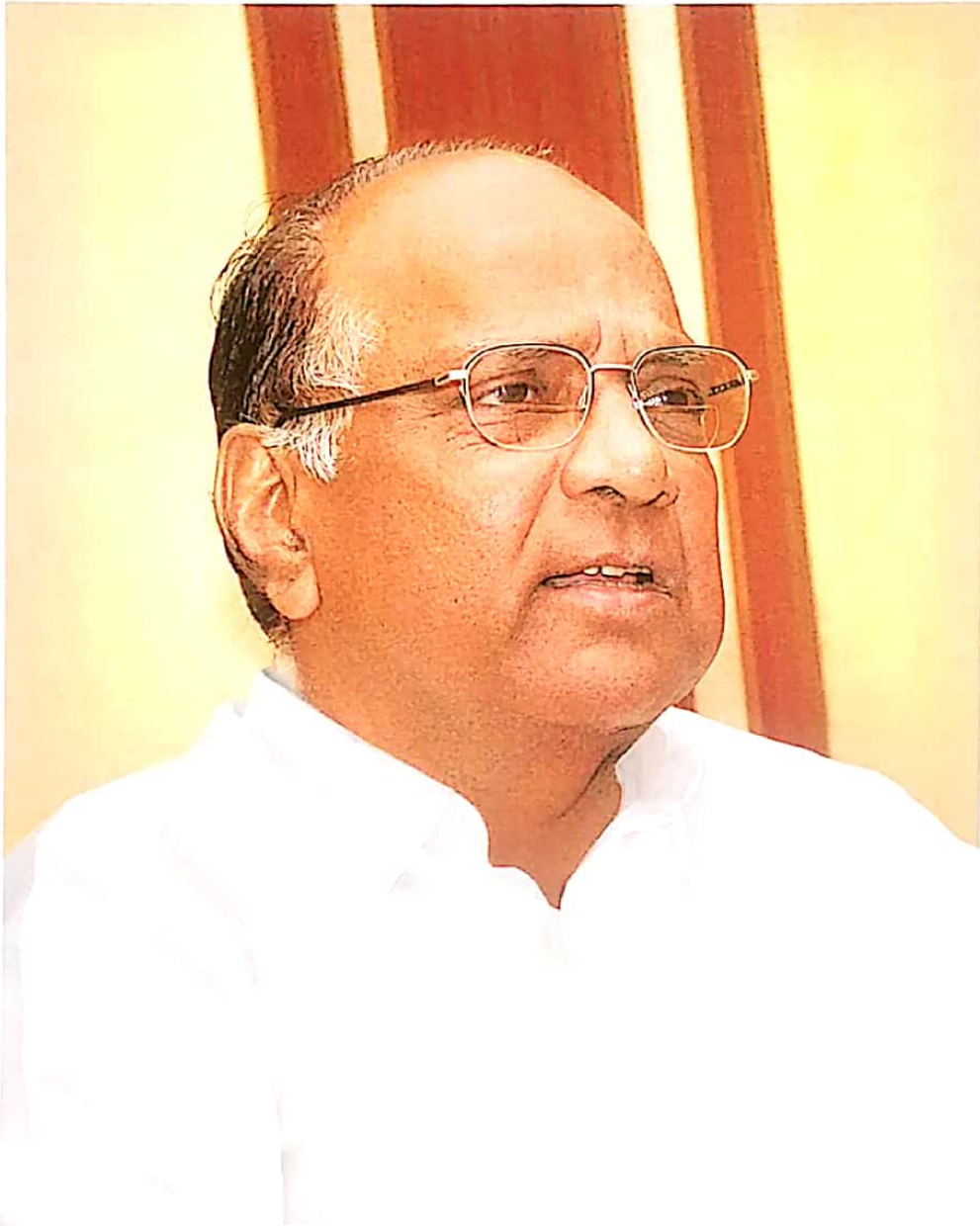
Padmavibhushan Hon'ble Sharad Pawar Ex. Union Cabinet Minister Agriculture & Food Processing Industries Government of India